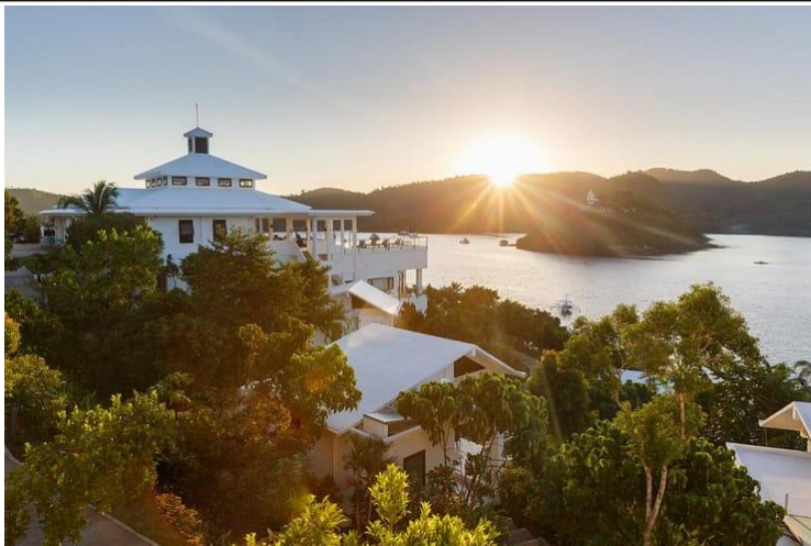
Busuanga Bay Lodge