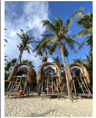
Coco Beach Resort