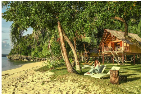
Resort3 Beachside Chalet w A/C

Resort 2 above is located in the Malcapuya group of islands, about one quarter of the distance along our route, hence a good spot for one overnight stay. There are two other places in the immediate vicinity, Banana Island Resort and Coco Beach Resort [both huts], but they give precedence to a major group operator and it is too risky to book well in advance, since they do not know their schedule then, which can also change last minute. For this reason we prefer to book at these places closer to your tour date and why we have reached out to the fancier resorts in the Coron area (some examples below). There you will find many more choices, some nearby, some requiring 4,000p extra to cover the extra distance from our usual route, and some of which we can book for you directly ourselves at less than the charged airbnb price.