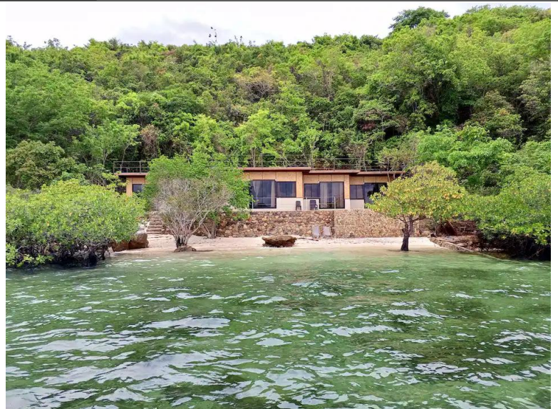
Entire Beachfront Home