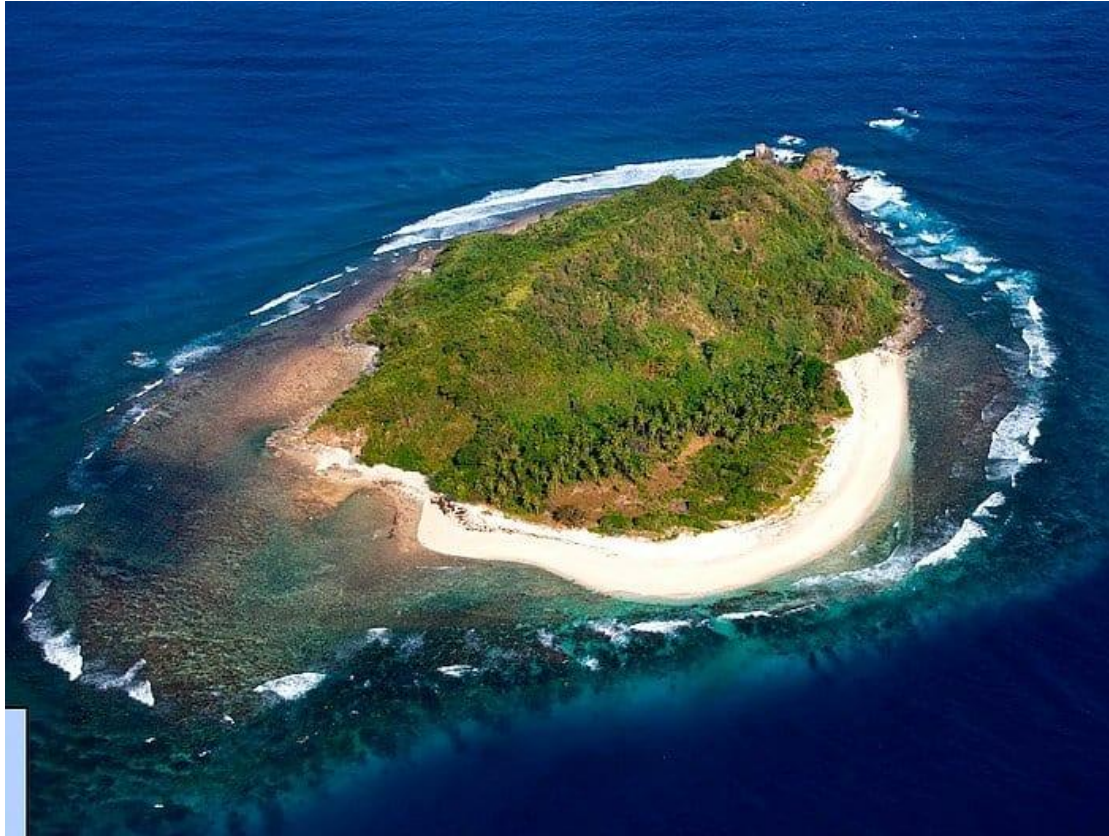
Bolina island, one of the several ones you can rent for yourselves and camp out on alone.

One good thing about customizing your own tour, besides the ability to evade the crowds and group tours, is that you can choose from a variety of accommodation. From air-conditioned hotels, to beach huts, to camping on a deserted island – the world is your oyster. Or simply tell us your preferences and we'll prepare a package proposal for you.